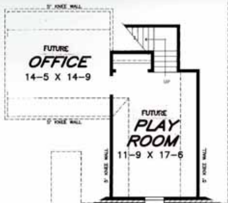
FUTURE SECOND FLOOR PLAN