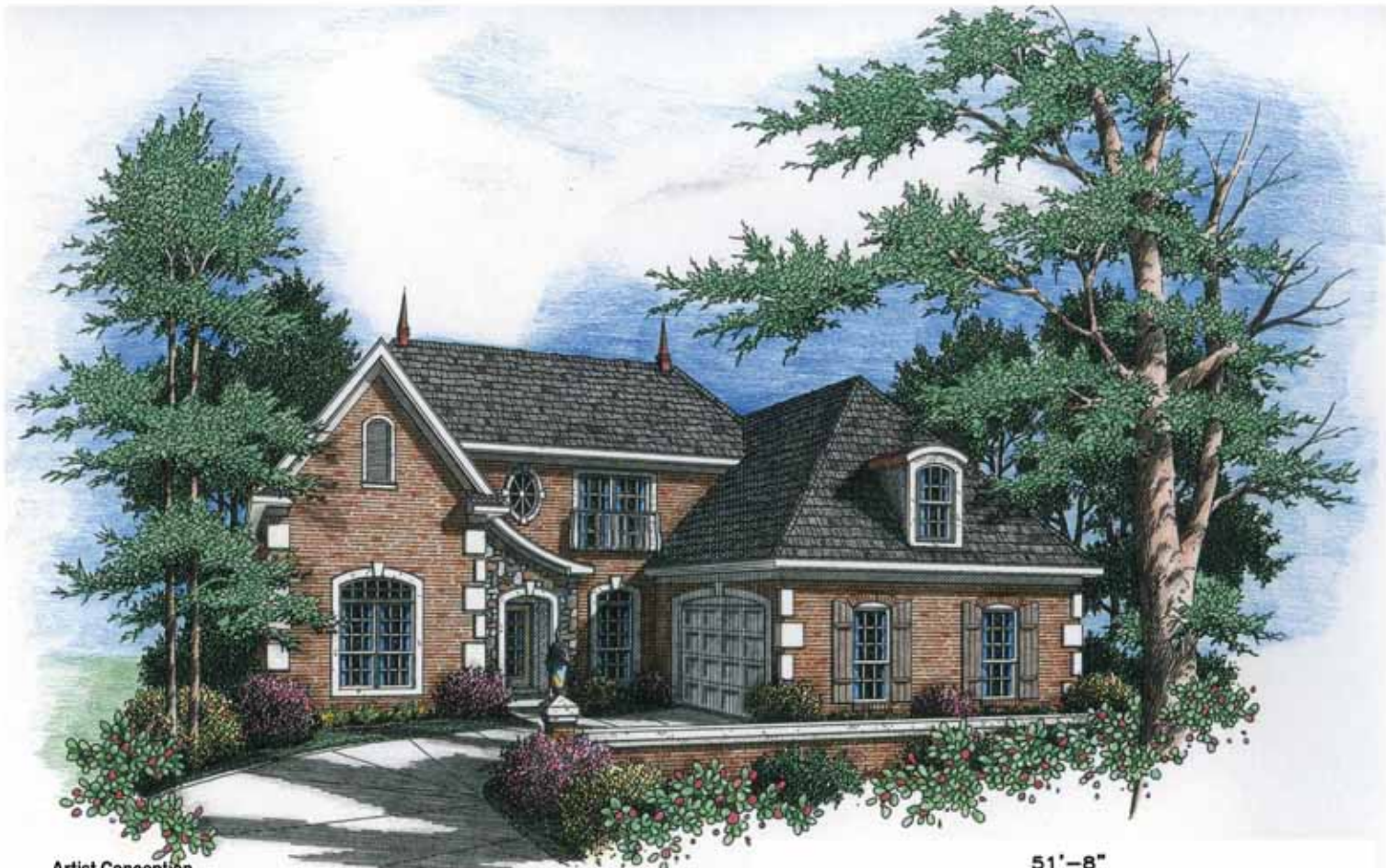
Artist Conception Actual Construction May Vary